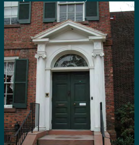
Entry to Rectory