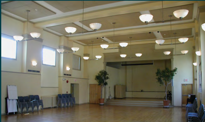
Parish House Multi-purpose Assembly Room

Halpern Architects assisted the congregation of St. Anne's to restore the historic Rectory, and upgrade the Parish house. The project included improving the spaces for both the congregation and its youth groups, providing for Sunday school classrooms, adapting adult classrooms to a pre-school, reworking the existing meeting rooms, and rehearsal spaces. Halpern Architects designed the conversion of an existing gymnasium into a multi-purpose assembly room suitable for parties, lectures, recitals and receptions. Halpern Architects prepared a conditions assessment and "restoration procedure manual" for the original historic Rectory. Substantial material conservation work was undertaken on the exterior of the older portions of the buildings including restoring failing building components such as windows, flashing, and other roofing materials. The project scope also included a focus on addressing code compliance, energy efficiency improvements, and accessibility requirements.