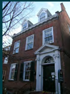
Entry to Rectory