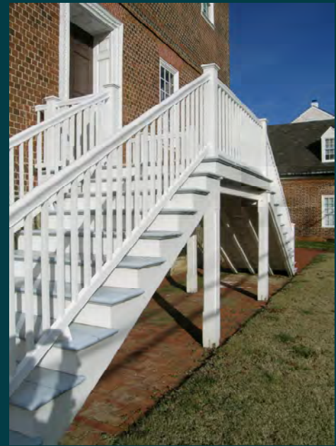
Detail of new entrance staircase