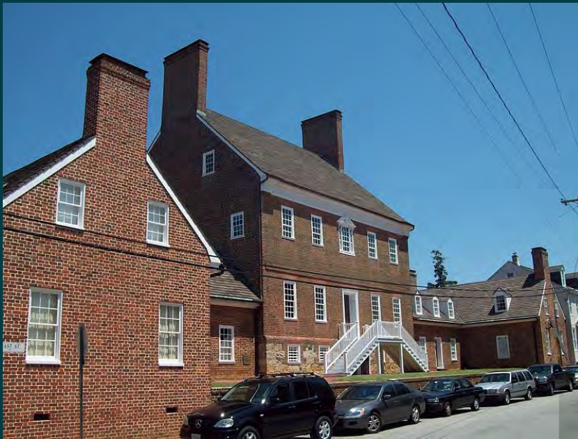
Main façade of the Brice House facing onto East Street