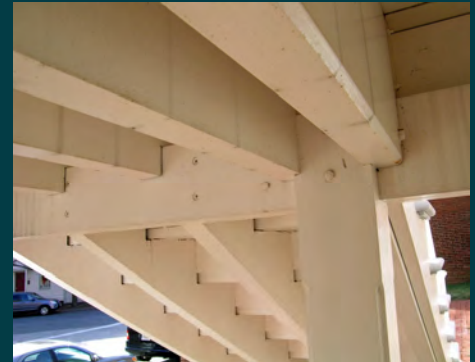
Underside detail of new staircase